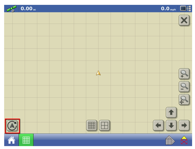
Figure 2 - Press center of map screen and heading change button will appear

When Heading Detection is disabled, the GPS heading will always be considered as forward.